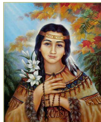
SAINT KATERI TEKAWITHA – LILY OF THE MOHAWKS