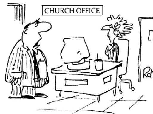
"If telemarketers call, invite them to church."